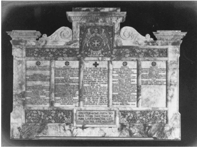
Memorial to the men who lost their lives, from the Grand Priory Church, Clerkenwell (destroyed in the Second World War)

medical Orderlies serving in South Africa were St. John men. To their regret, however, the women Nursing members of the Brigade were not employed overseas, but many were involved in the despatch of supplies throughout the war.