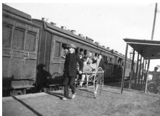
Litter Ambulance from hospital

By 13 November, the first 23 men had arrived for kitting out at St. John's Gate and embarked for South Africa on 21 st November. They were followed by over 1800 men, about one fifth of the total strength of the Brigade. As all were volunteers, some Brigade divisions and Corps provided more men than others and the largest contingents over 100 men each came from London, Oldham and Bolton. In Oldham, 128 of the 226 members of the Ambulance Division were enlisted. These men usually signed on for periods of six months and served in a variety of posts including General, Stationary and Field Hospitals as well as Hospital Ships and Trains. They worked as stretcher bearers, orderlies, wardmasters, clerks and dispensers and were paid on RAMC scales. One quarter of the