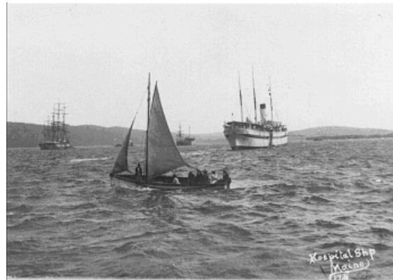
The Hospital Ship Maine

Only 11 members of the St. John Ambulance Brigade served on the MAINE as orderlies and received the China Medal. All had previously qualified for the Queen's South Africa Medal, whether aboard MAINE or elsewhere.