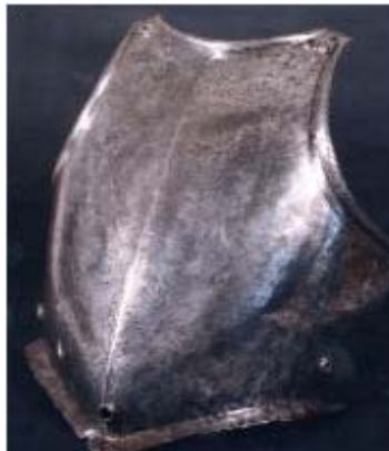
plate armour left in Rhodes when the Order departed in 1523.

By the 13 th century knights were finding mail armour not only uncomfortable but inadequate protection against weapons such as war hammers and two-handed swords. At first plate armour was simply added to mail armour, but from the 1400s knights wore entire suits of plate armour. The museum has some of the